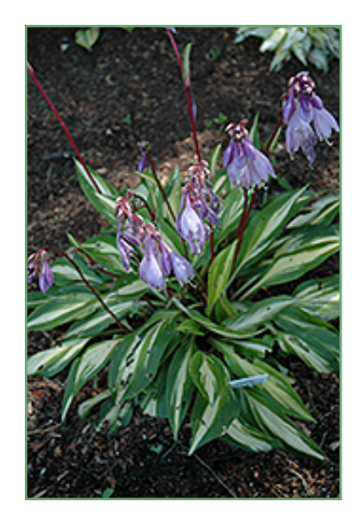
Cherry Berry Hosta in bloom