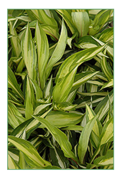
Cherry Berry Hosta foliage