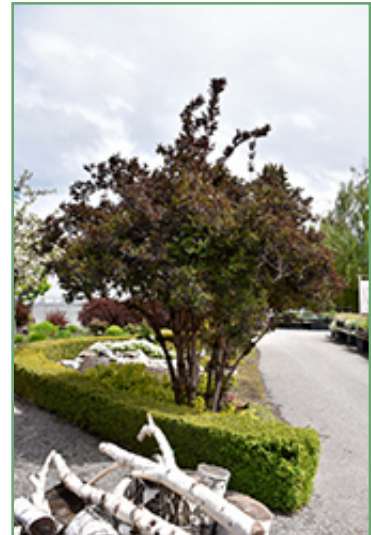
Black Beauty Elder