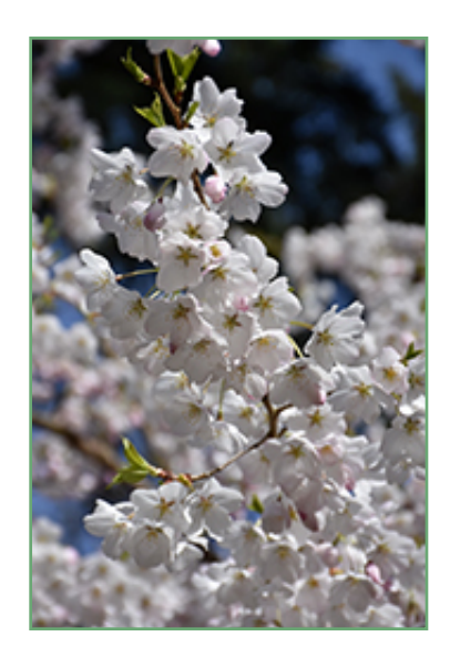
Akebono Yoshino Cherry flowers