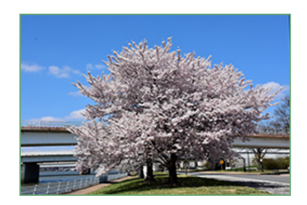
Akebono Yoshino Cherry in bloom