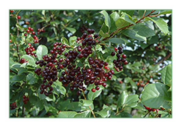
Chokecherry fruit