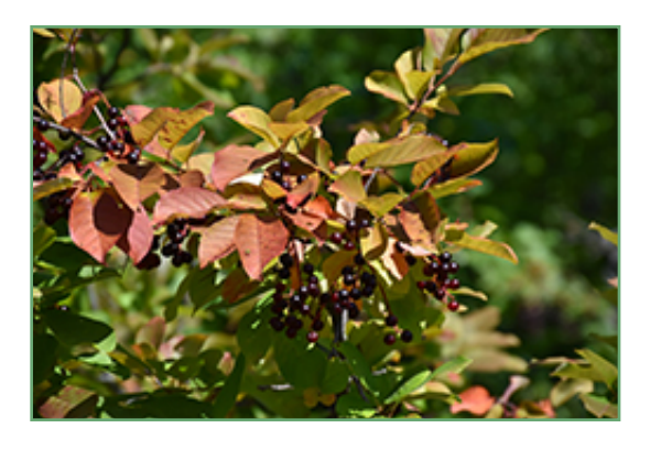
Chokecherry fruit

Chokecherry will grow to be about 25 feet tall at maturity, with a spread of 20 feet. It has a low canopy with a typical clearance of 4 feet from the ground, and is suitable for planting under power lines. It grows at a medium rate, and under ideal conditions can be expected to live for 40 years or more. This is a self-pollinating variety, so it doesn't require a second plant nearby to set fruit.