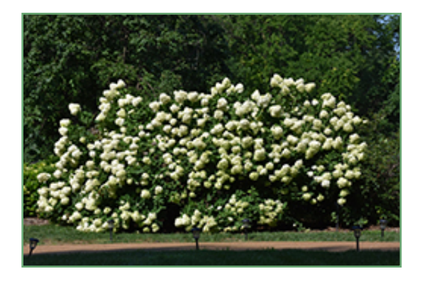
Limelight Hydrangea in bloom