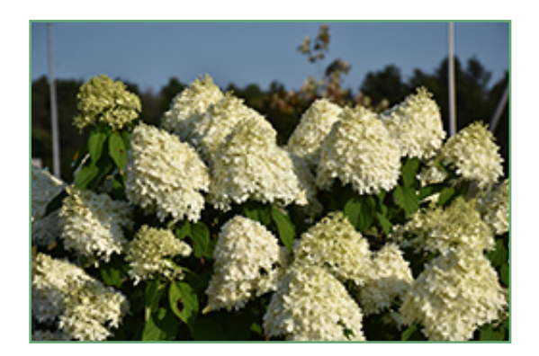
Limelight Hydrangea flowers