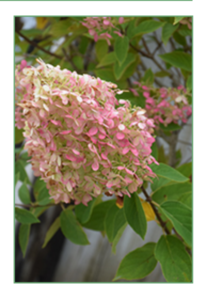
Limelight Hydrangea flowers (faded)

This shrub performs well in both full sun and full shade. It prefers to grow in average to moist conditions, and shouldn't be allowed to dry out. It is not particular as to soil type or pH. It is highly tolerant of urban pollution and will even thrive in inner city environments. Consider applying a thick mulch around the root zone in winter to protect it in exposed locations or colder microclimates. This is a selected variety of a species not originally from North America.