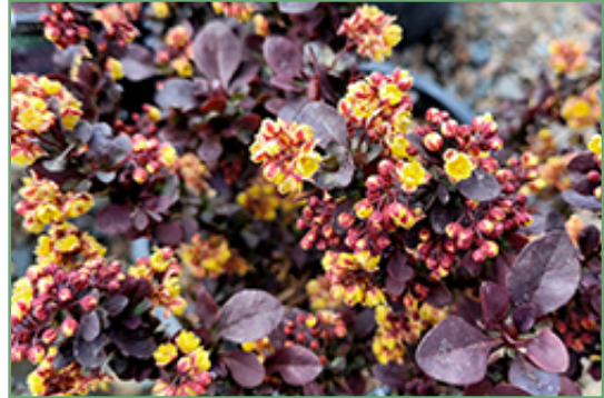
Concorde Japanese Barberry flowers

Concorde Japanese Barberry will grow to be about 18 inches tall at maturity, with a spread of 24 inches. It tends to fill out right to the ground and therefore doesn't necessarily require facer plants in front. It grows at a slow rate, and under ideal conditions can be expected to live for approximately 20 years.