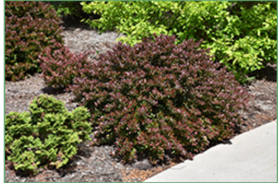
Concorde Japanese Barberry

Concorde Japanese Barberry is recommended for the following landscape applications;