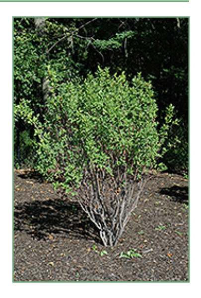
Rainbow Pillar Serviceberry

Rainbow Pillar Serviceberry is recommended for the following landscape applications;