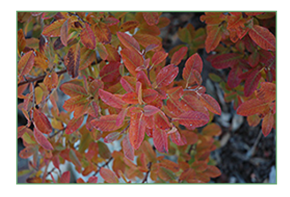
Rainbow Pillar Serviceberry in fall