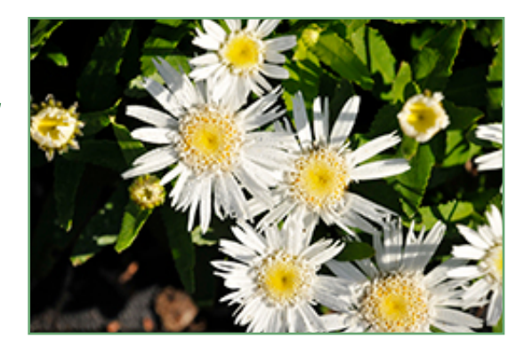
Lancaster Double Angel Shasta Daisy flowers