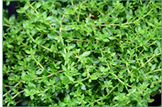
Rupturewort foliage

Rupturewort is recommended for the following landscape applications;