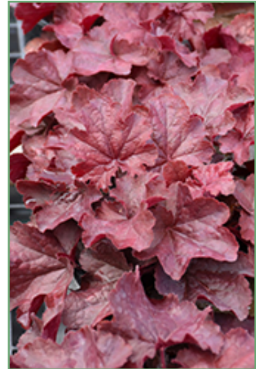
Northern Exposure Red Coral Bells foliage