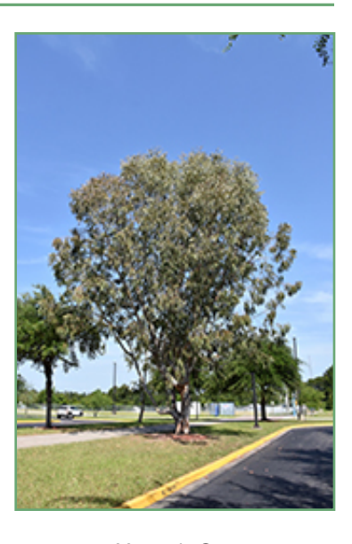
Mountain Gum