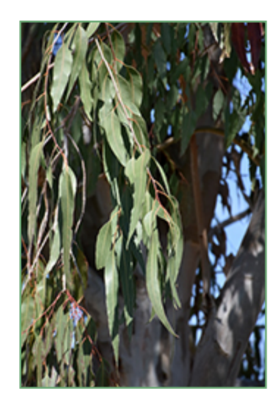
Mountain Gum foliage