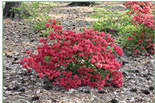
Girard's Crimson Azalea in bloom