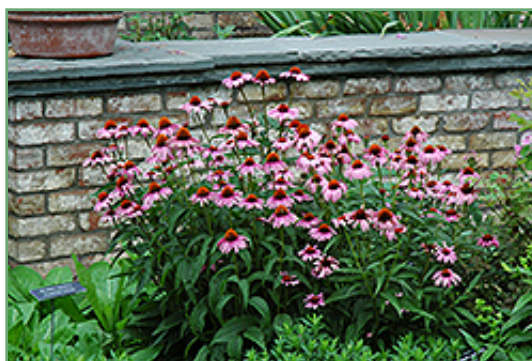
Magnus Coneflower in bloom