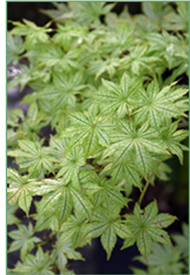
Shigitatsu Sawa Japanese Maple foliage