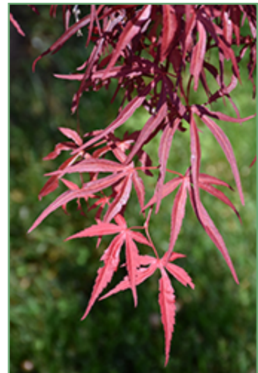
Red Spider Japanese Maple foliage