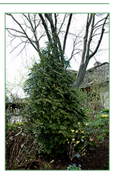
Excelsa Red Cedar

Excelsa Red Cedar will grow to be about 30 feet tall at maturity, with a spread of 15 feet. It has a low canopy, and should not be planted underneath power lines. It grows at a medium rate, and under ideal conditions can be expected to live for 50 years or more.