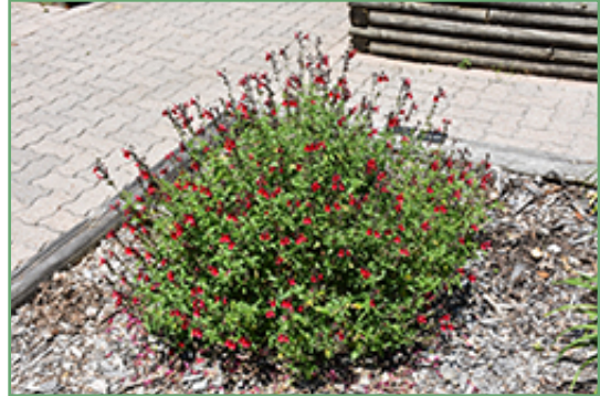
Radio Red Autumn Sage in bloom

Radio Red Autumn Sage will grow to be about 14 inches tall at maturity, with a spread of 16 inches. When grown in masses or used as a bedding plant, individual plants should be spaced approximately 12 inches apart. It grows at a medium rate, and under ideal conditions can be expected to live for approximately 5 years. As an evergreen perennial, this plant will typically keep its form and foliage year-round.