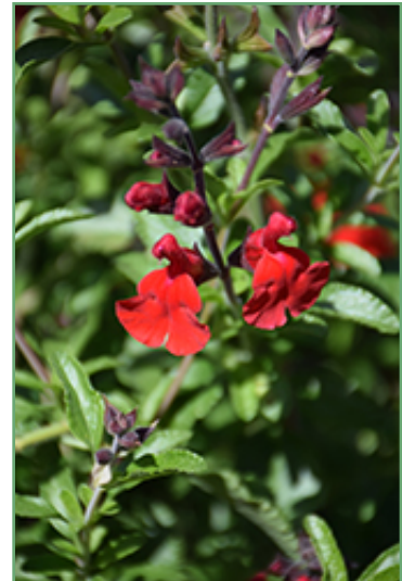
Radio Red Autumn Sage flowers