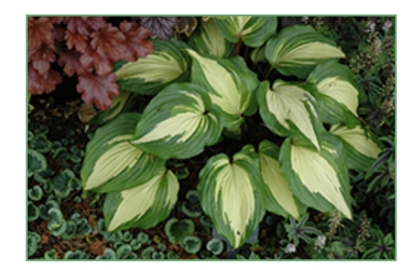
Raspberry Sundae Hosta