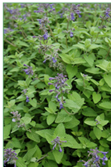
Limelight Catmint flowers