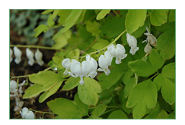
White Gold Bleeding Heart flowers

A vigorous variety with delicate and pedulous clusters of pure white flowers in late spring, over ferny golden foliage that is delicate and finely cut; an outstanding garden accent