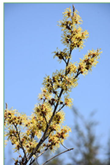
Arnold Promise Witchhazel flowers

Arnold Promise Witchhazel is recommended for the following landscape applications;