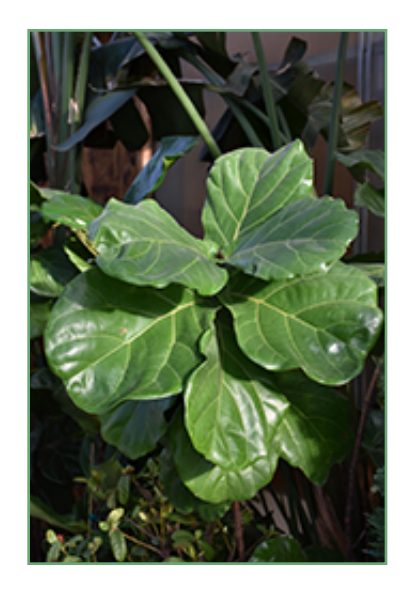
Fiddle Leaf Fig foliage