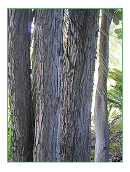
Fiddle Leaf Fig bark

This tree does best in full sun to partial shade. It does best in average to evenly moist conditions, but will not tolerate standing water. It is not particular as to soil type, but has a definite preference for acidic soils, and is able to handle environmental salt. It is highly tolerant of urban pollution and will even thrive in inner city environments. Consider applying a thick mulch around the root zone in winter to protect it in exposed locations or colder microclimates. This species is not originally from North America, and parts of it are known to be toxic to humans and animals, so care should be exercised in planting it around children and pets.