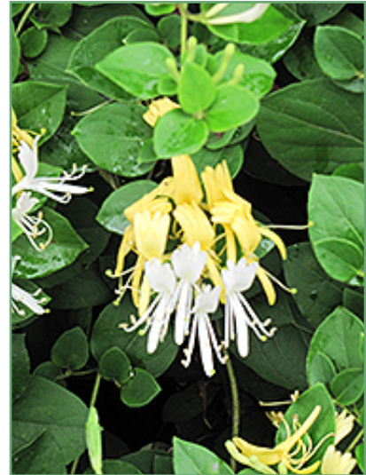
Hall's Japanese Honeysuckle flowers