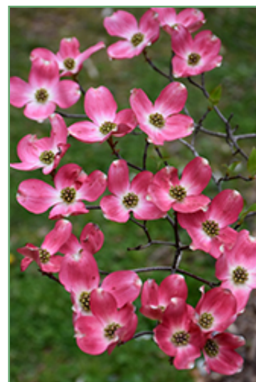
Red Flowering Dogwood flowers