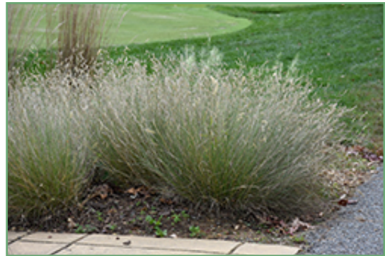
Blonde Ambition Blue Grama Grass fruit