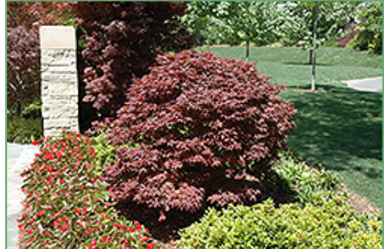
Rhode Island Red Japanese Maple