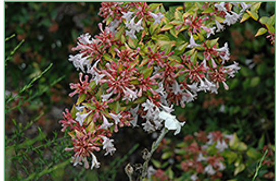
Francis Mason Abelia flowers