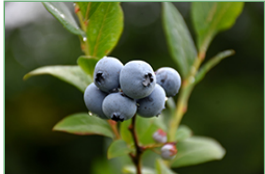
Northsky Blueberry fruit

This is a multi-stemmed deciduous shrub with an upright spreading habit of growth. Its relatively fine texture sets it apart from other landscape plants with less refined foliage. This is a relatively low maintenance plant, and usually looks its best without pruning, although it will tolerate pruning. It is a good choice for attracting birds to your yard. It has no significant negative characteristics.