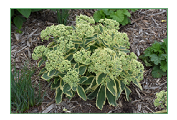
Elsie's Gold Stonecrop in bloom

6261 Hammond Bay Rd. Nanaimo, BC, V9T 5M4 phone: 250-758-0808 www.greenthumbwholesale.com