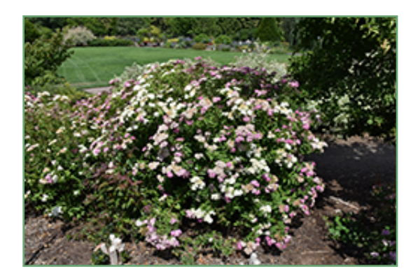
Shirobana Spirea in bloom

Shirobana Spirea is recommended for the following landscape applications;