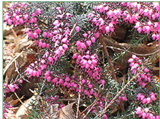
Spring Heath flowers