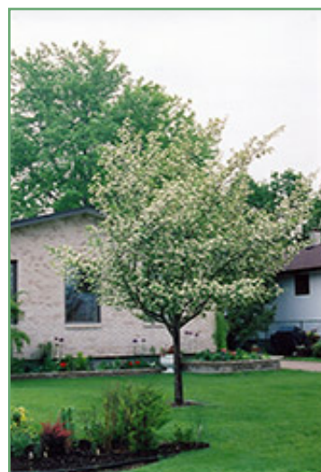
Snowbird Hawthorn in bloom