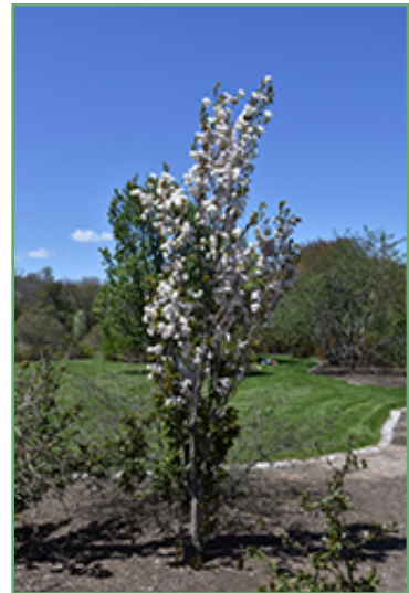
Amanogawa Flowering Cherry in bloom