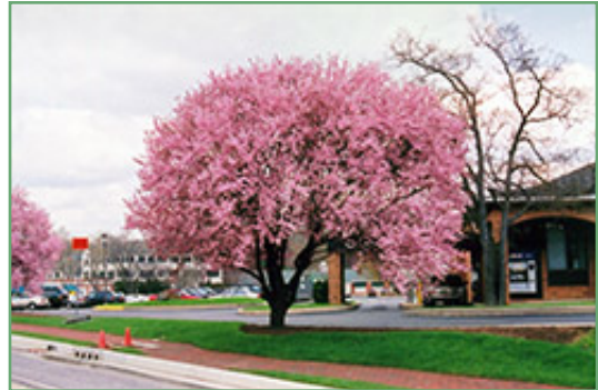
Thundercloud Plum in bloom