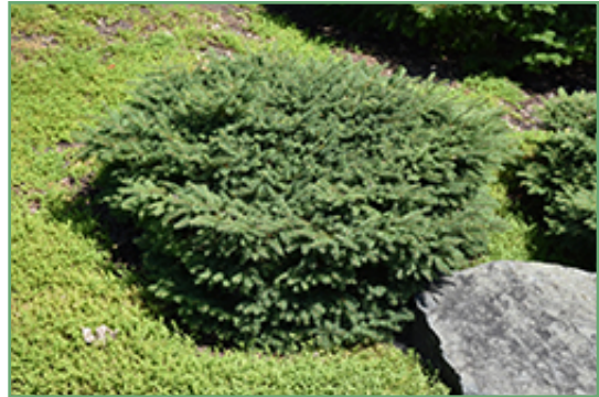
Birds Nest Spruce

Birds Nest Spruce will grow to be about 4 feet tall at maturity, with a spread of 5 feet. It tends to fill out right to the ground and therefore doesn't necessarily require facer plants in front. It grows at a slow rate, and under ideal conditions can be expected to live for 50 years or more.