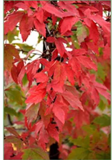
Paperbark Maple in fall

This tree does best in full sun to partial shade. It prefers to grow in average to moist conditions, and shouldn't be allowed to dry out. It is not particular as to soil type or pH. It is somewhat tolerant of urban pollution. This species is not originally from North America.