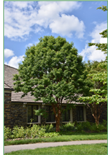
Paperbark Maple

Paperbark Maple will grow to be about 30 feet tall at maturity, with a spread of 25 feet. It has a high canopy with a typical clearance of 6 feet from the ground, and should not be planted underneath power lines. As it matures, the lower branches of this tree can be strategically removed to create a high enough canopy to support unobstructed human traffic underneath. It grows at a slow rate, and under ideal conditions can be expected to live for 80 years or more.