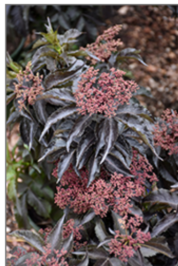
Black Tower Elder flower buds

Black Tower Elder is recommended for the following landscape applications;