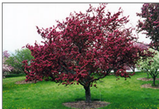
Profusion Flowering Crab in bloom

Profusion Flowering Crab will grow to be about 20 feet tall at maturity, with a spread of 25 feet. It has a low canopy with a typical clearance of 4 feet from the ground, and is suitable for planting under power lines. It grows at a medium rate, and under ideal conditions can be expected to live for 50 years or more.