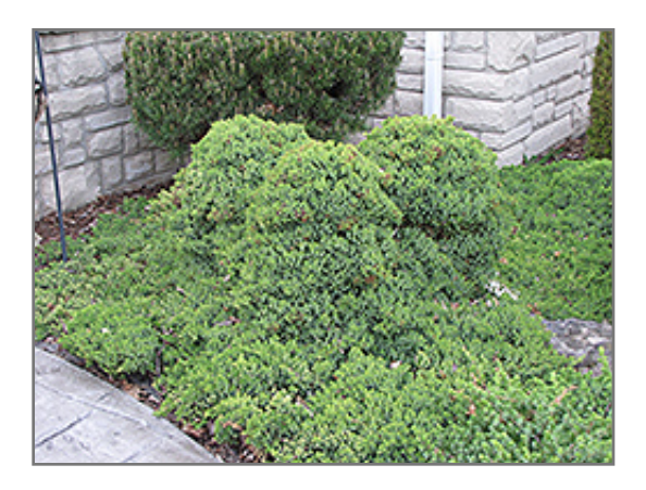
Dwarf Japanese Garden Juniper

4590 Bank St. Ottawa, ON, K1T 3W6 phone: 613-822-0383 www.knippelgardencentre.com