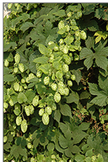
Nugget Ornamental Golden Hops fruit