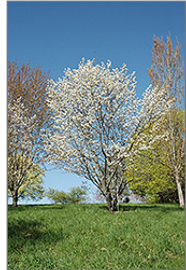
Princess Diana Serviceberry in bloom

Princess Diana Serviceberry will grow to be about 20 feet tall at maturity, with a spread of 15 feet. It has a low canopy with a typical clearance of 4 feet from the ground, and is suitable for planting under power lines. It grows at a medium rate, and under ideal conditions can be expected to live for 40 years or more.