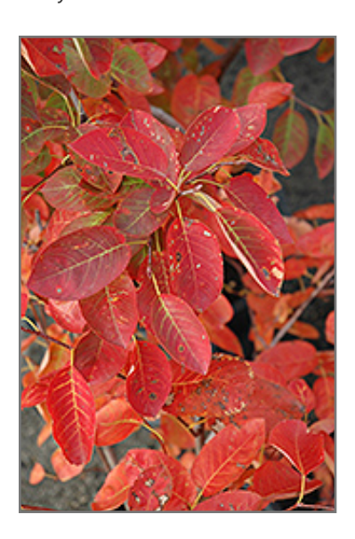
Autumn Brilliance Serviceberry in fall