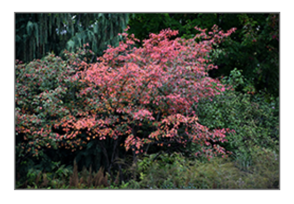
Autumn Brilliance Serviceberry in fall

This tree does best in full sun to partial shade. It prefers to grow in average to moist conditions, and shouldn't be allowed to dry out. It is not particular as to soil type or pH. It is somewhat tolerant of urban pollution. This particular variety is an interspecific hybrid.