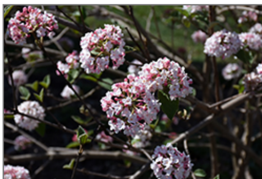
Koreanspice Viburnum flowers