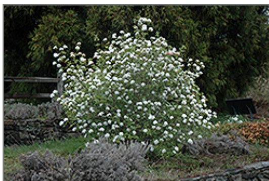
Koreanspice Viburnum in bloom

Koreanspice Viburnum is recommended for the following landscape applications;