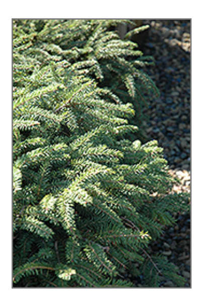
Elegans Spruce foliage