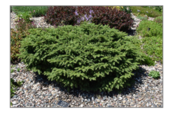
Elegans Spruce

This shrub should only be grown in full sunlight. It does best in average to evenly moist conditions, but will not tolerate standing water. It is not particular as to soil type or pH, and is able to handle environmental salt. It is highly tolerant of urban pollution and will even thrive in inner city environments. This is a selected variety of a species not originally from North America.