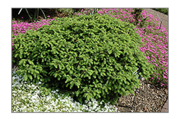
Elegans Spruce

4590 Bank St. Ottawa, ON, K1T 3W6 phone: 613-822-0383 www.knippelgardencentre.com