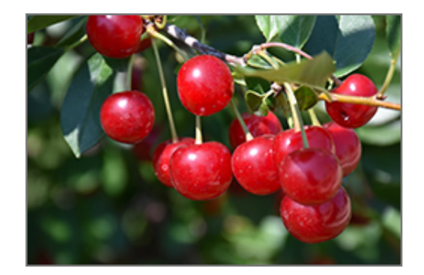
Valentine Cherry fruit