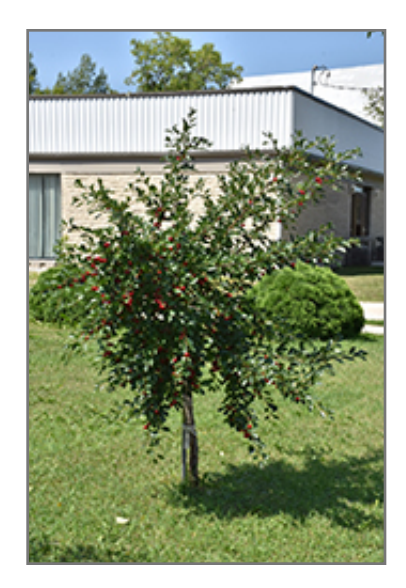
Valentine Cherry fruit