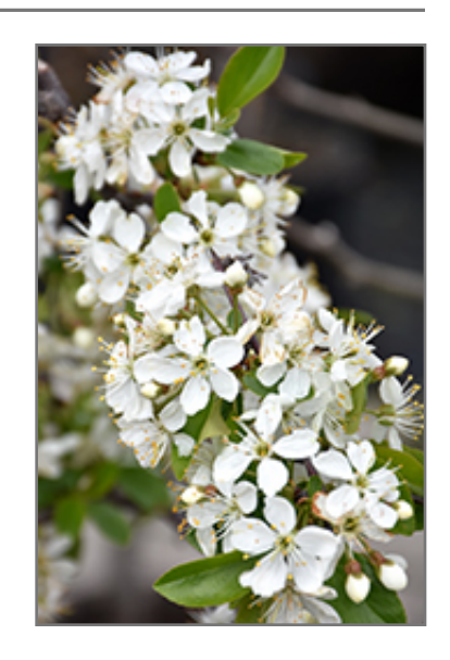
Valentine Cherry flowers

This shrub is typically grown in a designated area of the yard because of its mature size and spread. It should only be grown in full sunlight. It does best in average to evenly moist conditions, but will not tolerate standing water. It is not particular as to soil type or pH. It is highly tolerant of urban pollution and will even thrive in inner city environments. This particular variety is an interspecific hybrid.