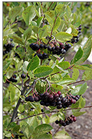
Iroquois Beauty Black Chokeberry fruit