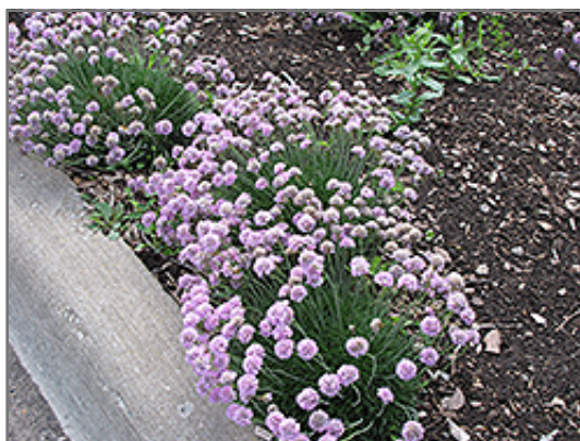
Juniper-Leaved Sea Thrift in bloom