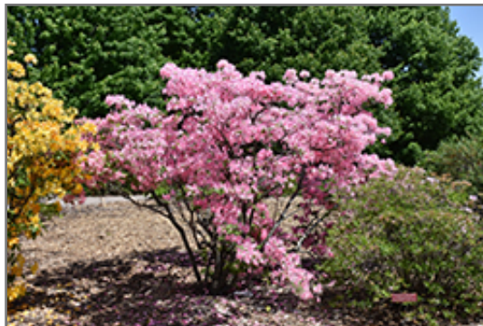
Northern Lights Azalea in bloom