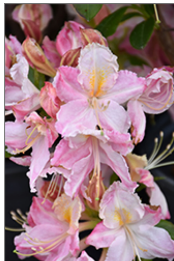
Tri-Lights Azalea flowers

Tri-Lights Azalea will grow to be about 4 feet tall at maturity, with a spread of 5 feet. It tends to be a little leggy, with a typical clearance of 1 foot from the ground. It grows at a slow rate, and under ideal conditions can be expected to live for 40 years or more.