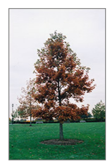
Swamp White Oak in fall