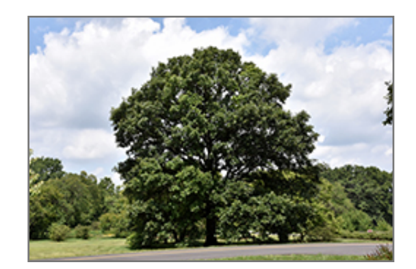
Swamp White Oak